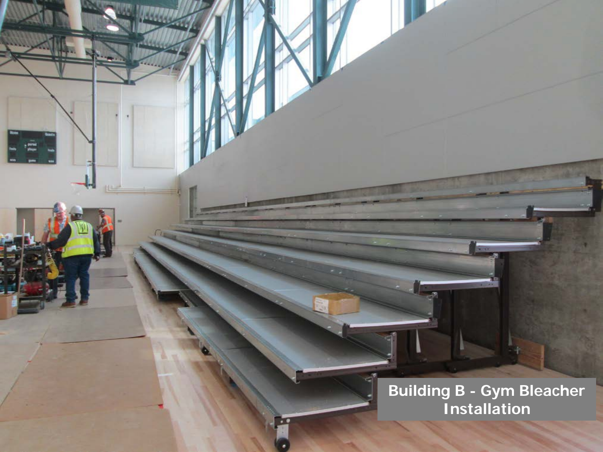
Building B - Gym Bleacher Installation