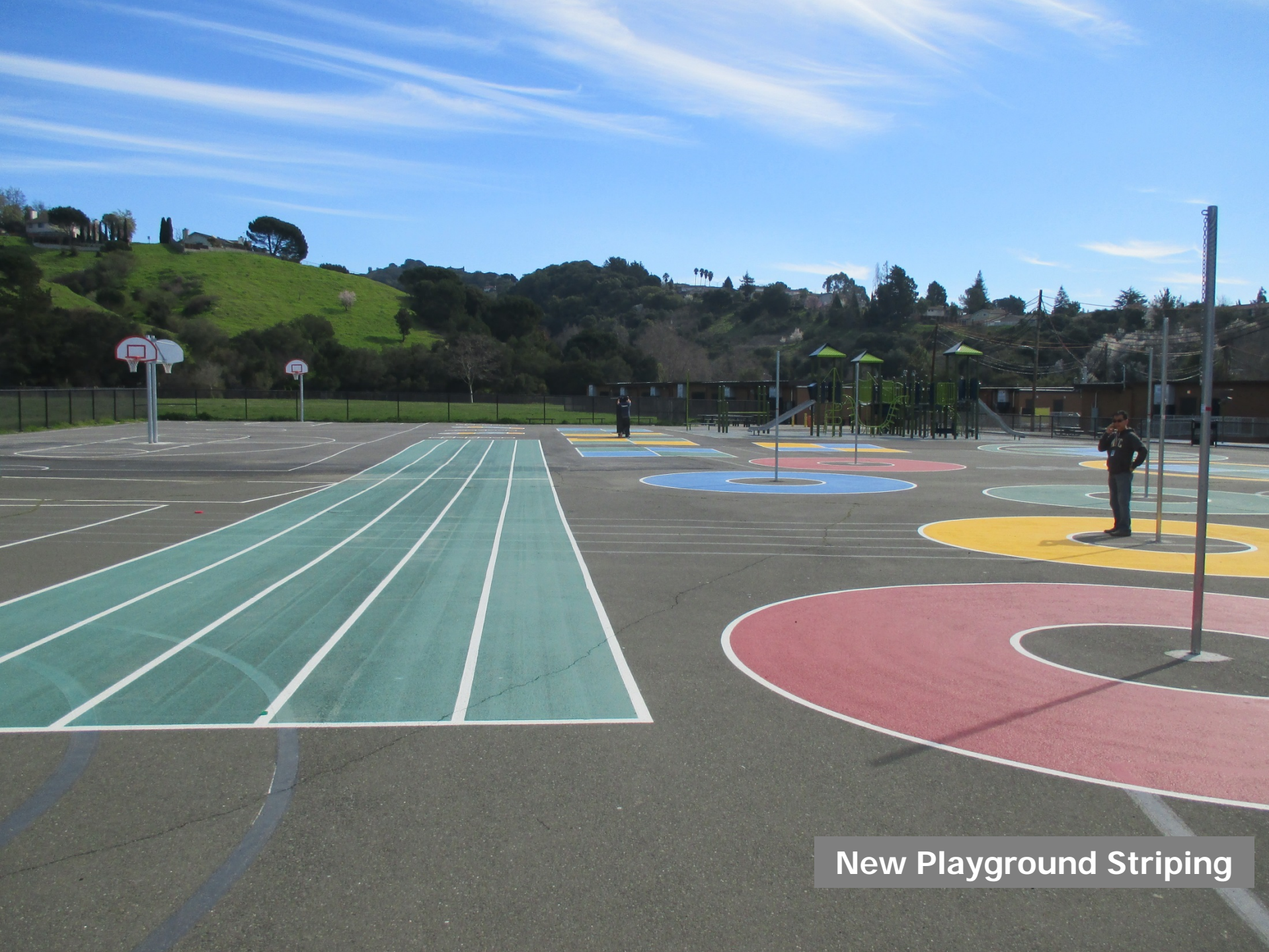
New Playground Striping