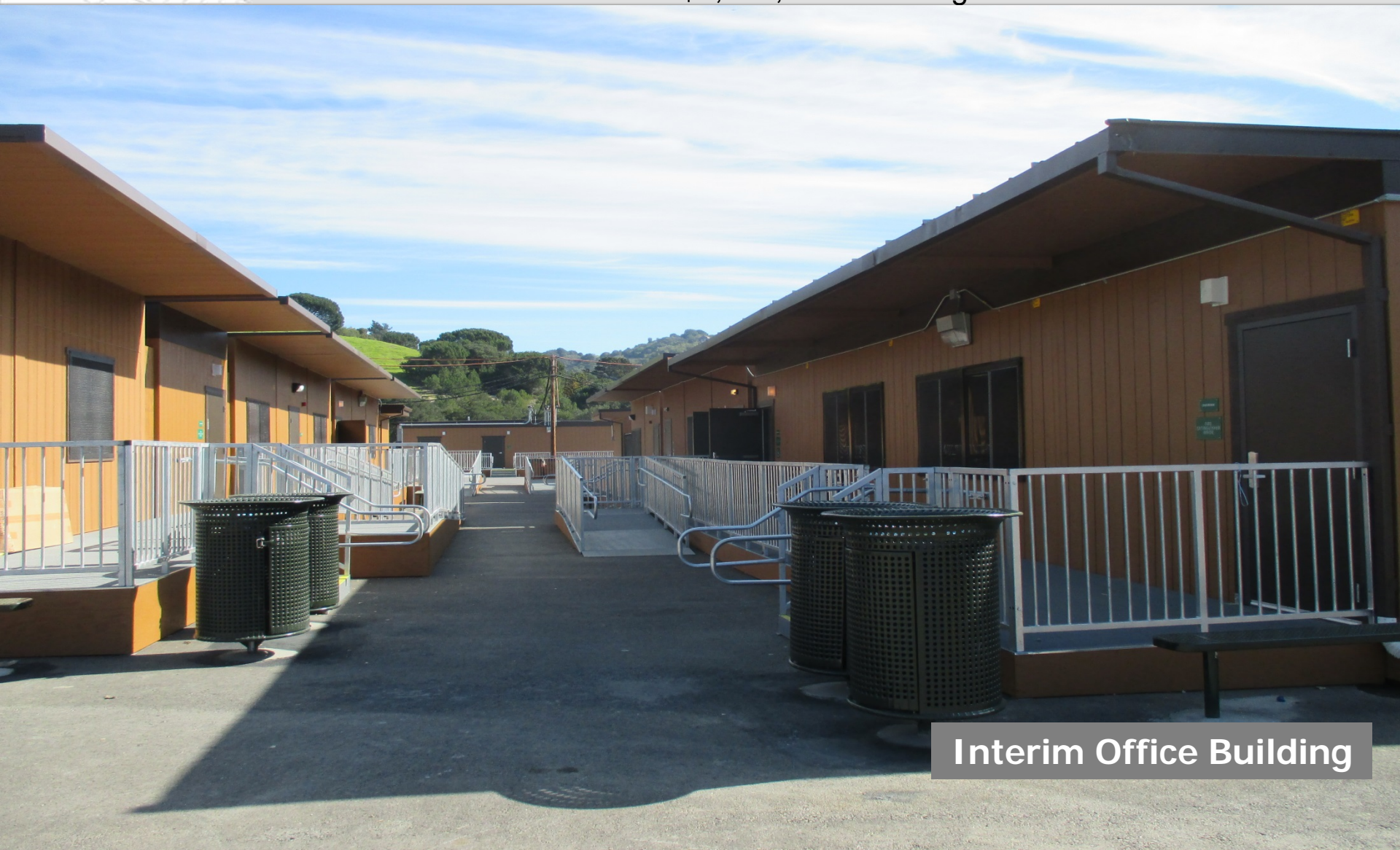
Interim Office Building

Contract Value: $3,466,000 Change Order: 4.11%