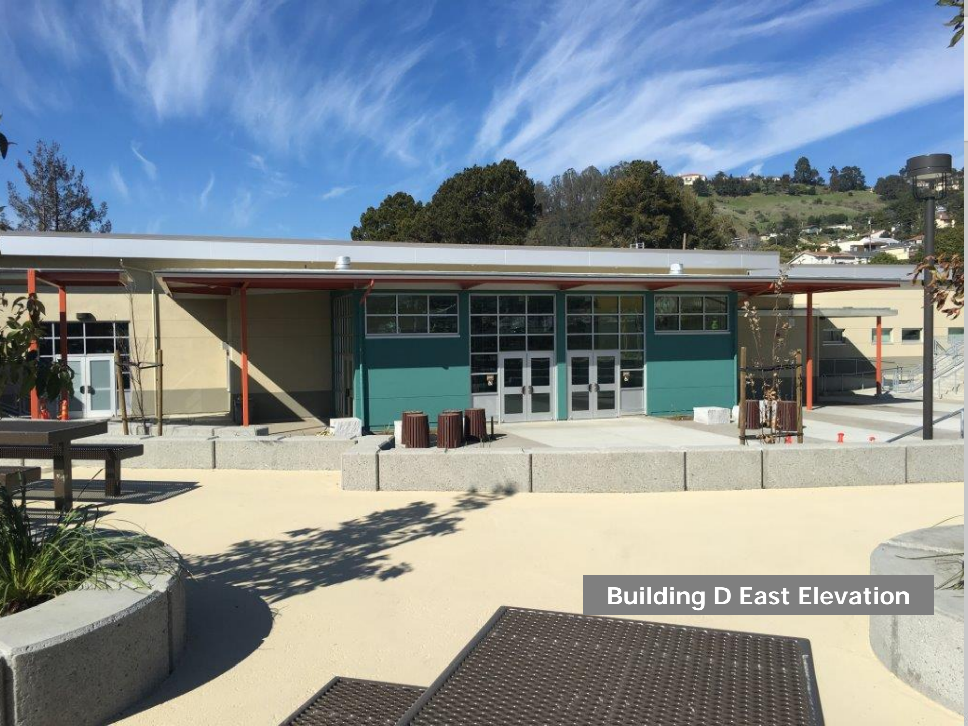
Building D East Elevation