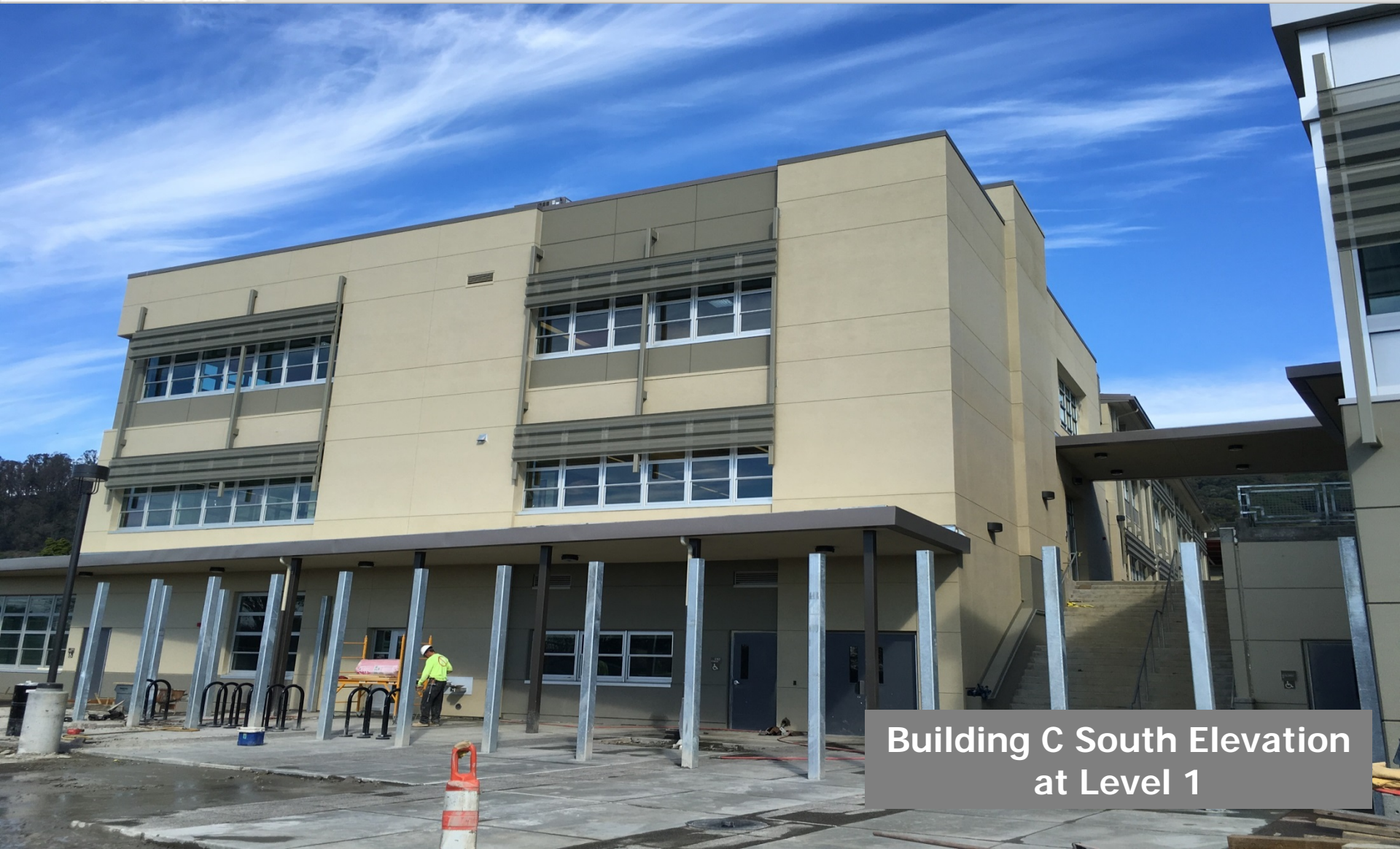
Building C South Elevation at Level 1

Contract Value: $42,762,406 Change Order: 3.13%