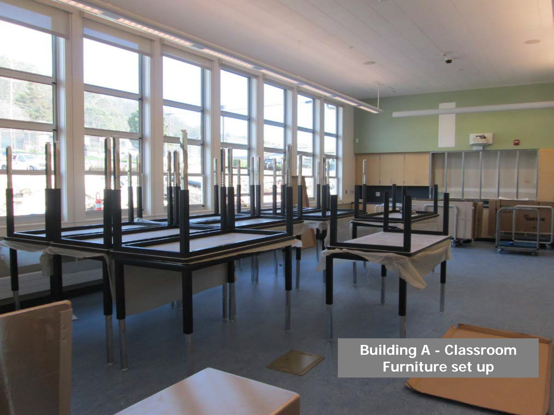
Building A - Classroom Furniture set up