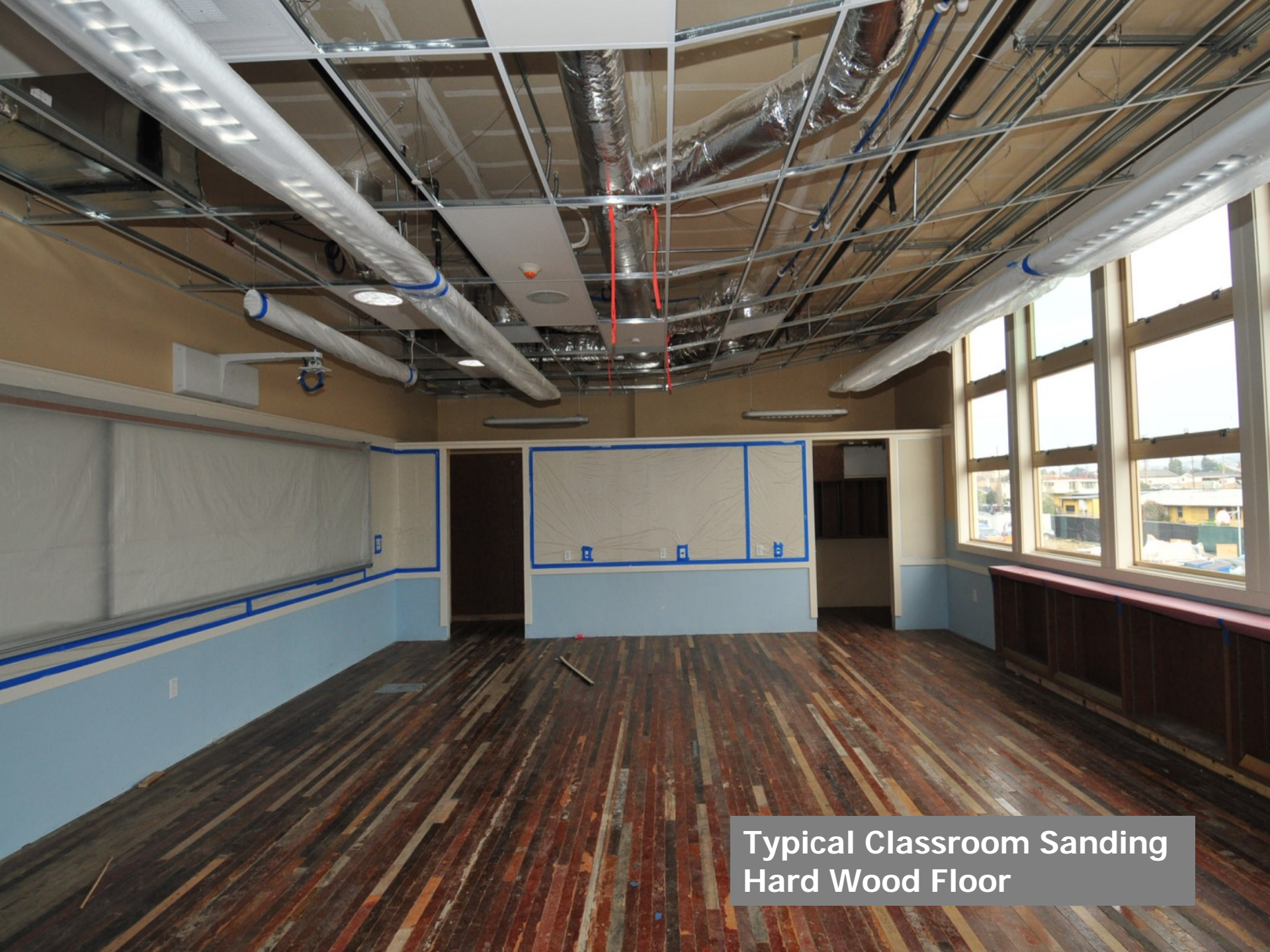
Typical Classroom Sanding Hard Wood Floor