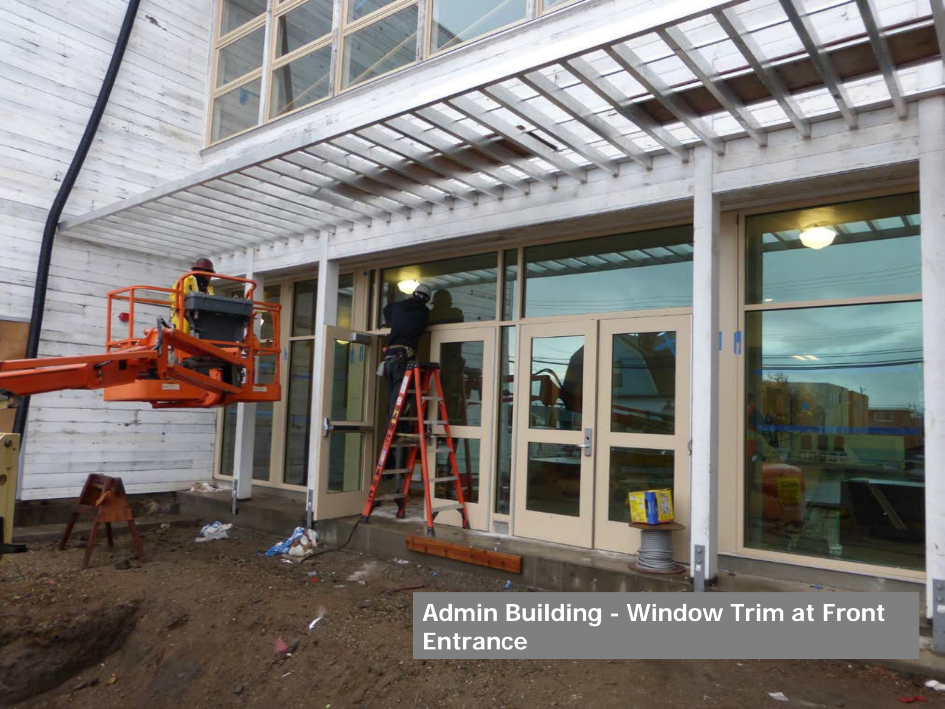
Admin Building - Window Trim at Front Entrance