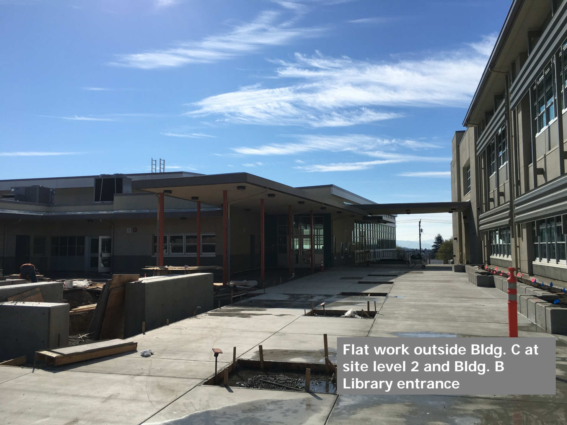
Flat work outside Bldg. C at site level 2 and Bldg. B Library entrance