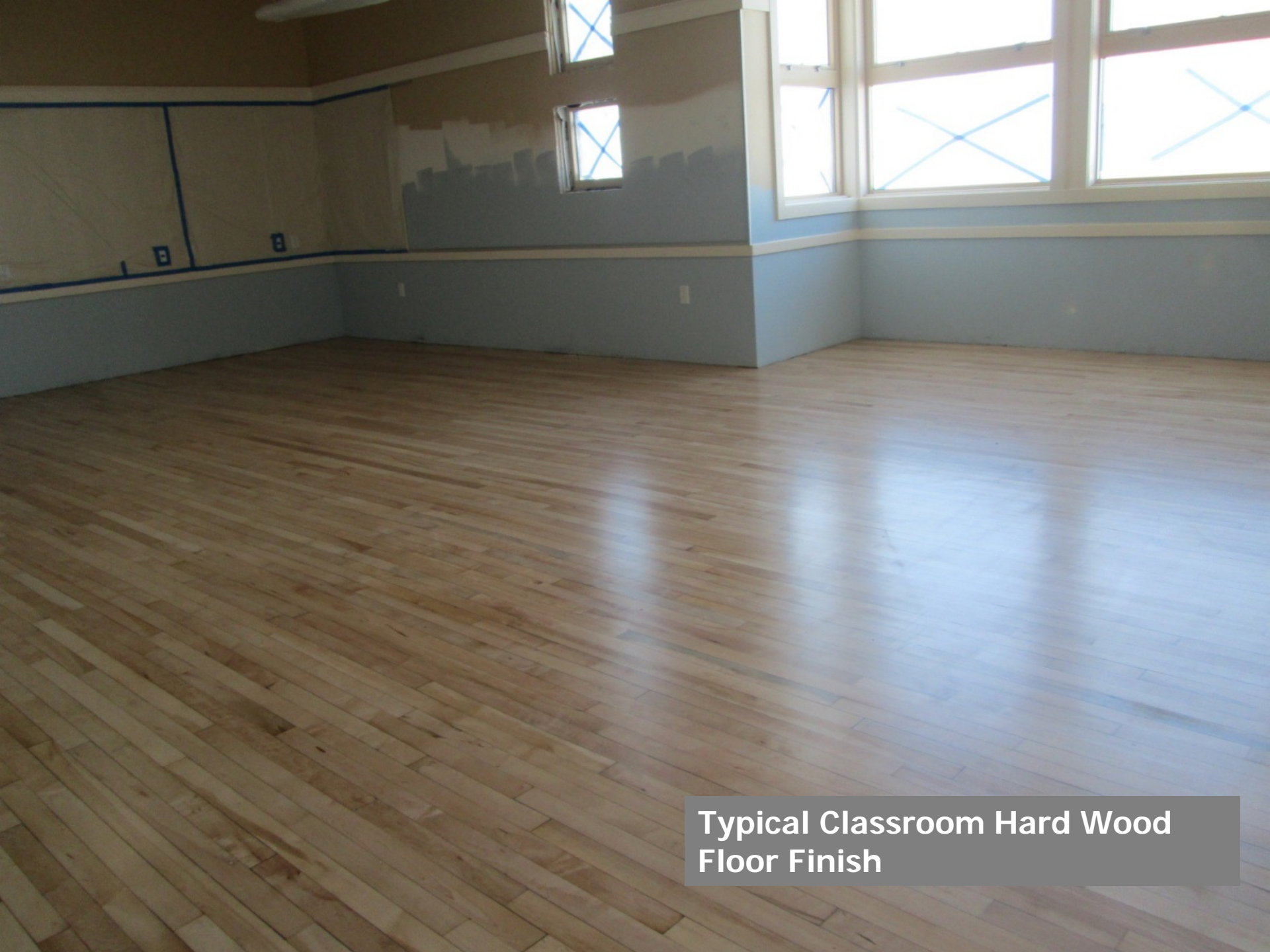
Typical Classroom Hard Wood Floor Finish