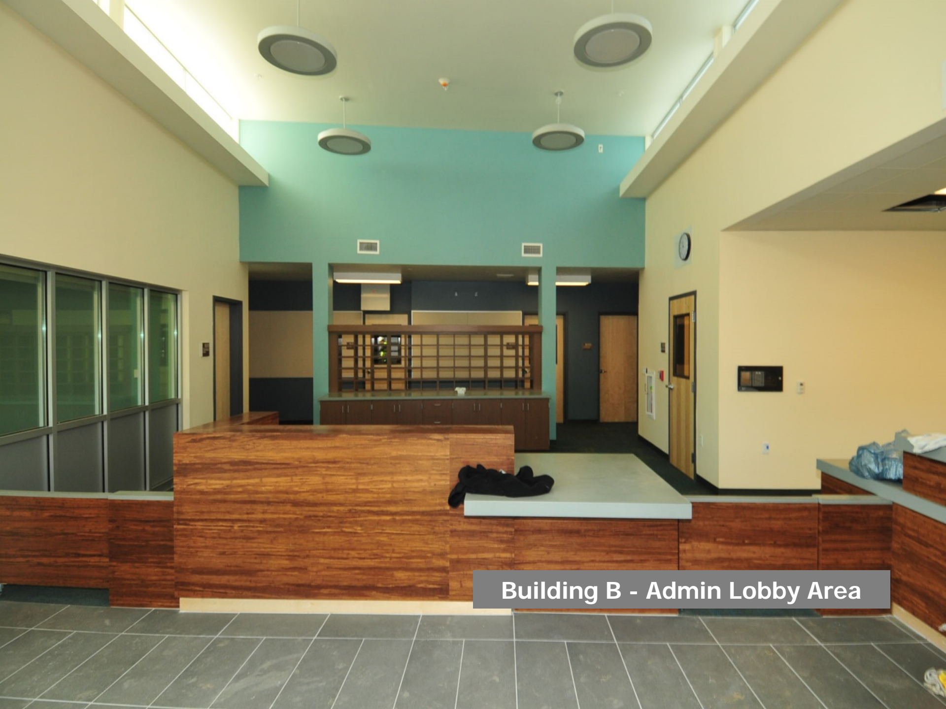
Building B - Admin Lobby Area