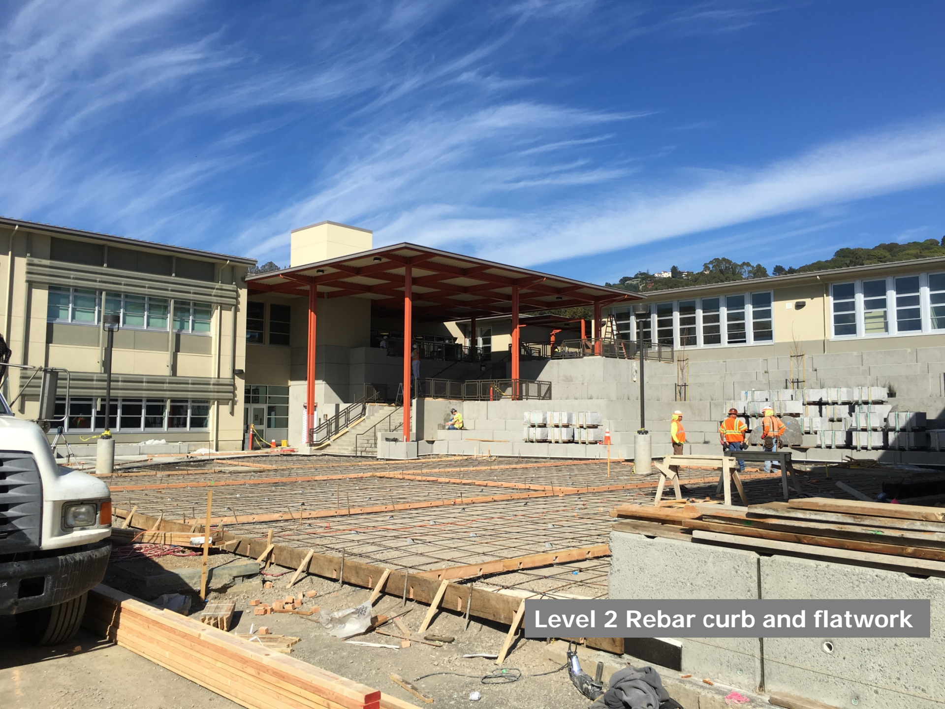
Level 2 Rebar curb and flatwork